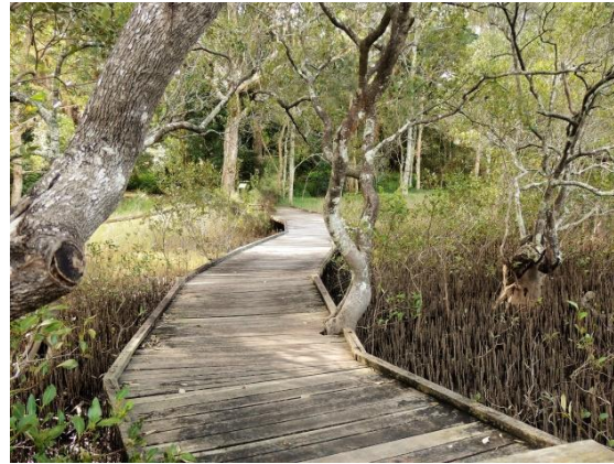
Mangrove board walk and creek walk

Walking paths and boardwalks allow for easy access. There is wheelchair access. (a wheelchair is available for use).